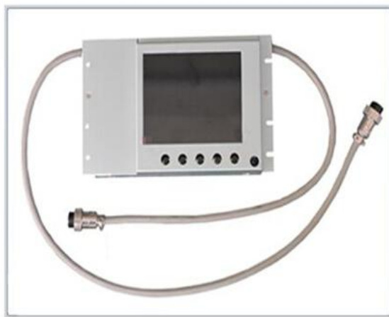
Security gate main control machine